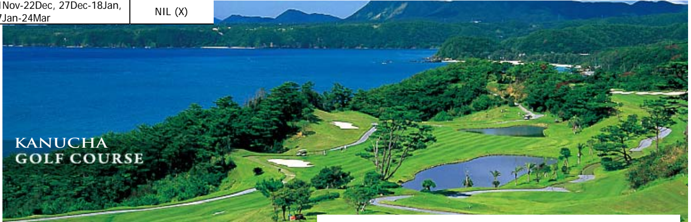
KANUCHA GOLF COURSE

Valid for departure 出發日期 01Nov-22Dec, 27Dec-18Jan, 27Jan-24Mar (other dates please check with us)