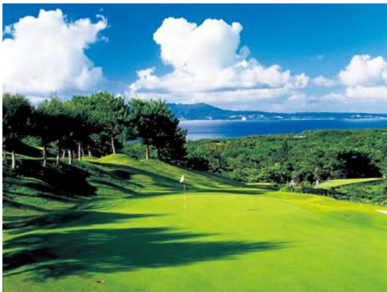
Chura Orchard Country Club (ex- Unimat Okinawa Golf)

Okinawa is Japan's answer to a golfing paradise. With warm weather and blue skies, it is possible to enjoy golfing all year round. Most golf courses have an excellent view of the emerald seas and elaborately designed courses on natural terrain. A wide selection of golf courses which are available. How about a game of golf under Okinawa's blue skies and lush greenery? The climate and environment of Okinawa makes it an excellent spot for golfing.